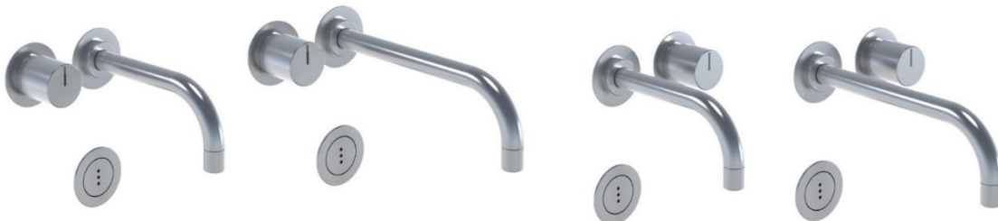
Figure 2: 4911VS, 4921VS, 4911VSX, 4921VSX

Eight products (4911, 4913, 4921, 4923, 4911VS, 4911VSX, 4921VS, 4921VSX) are calculated in six different surfaces (16 and 20, 19, 40, 27, 60, 64) and twelve product groups, see Figure 1 and Figure 2.