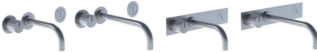
Figure 1: 4911, 4921, 4913, 4923